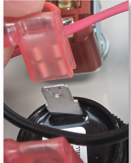
CONNECTING THE BUZZER